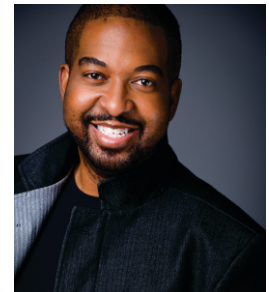
Composer National Music Educator