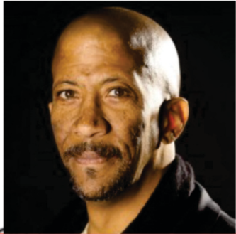
REG E. CATHEY